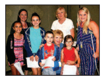
The Junior Committee with some of the Junior prize winners

The RA summer family charitable gifting project was