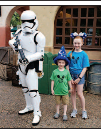
The Orr Juniors visited Disney World.