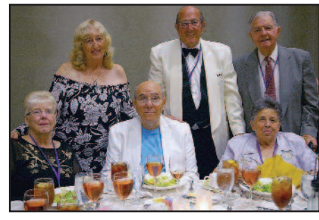
California and Pennsylvania members