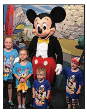
The Benoit Juniors posed with Mickey