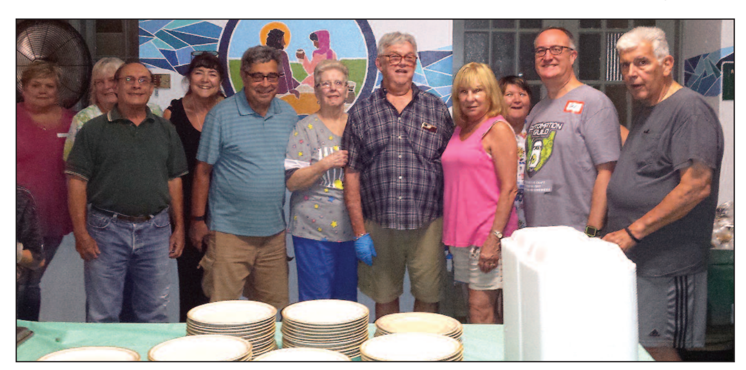
Members of Integrity Council #586 served dinner at Grace Cafe in Philadelphia.