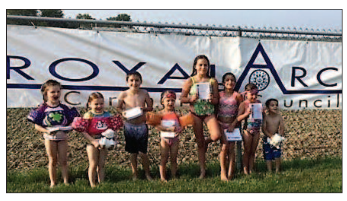
The Juniors posed with their gifts from the Royal Arcanum.