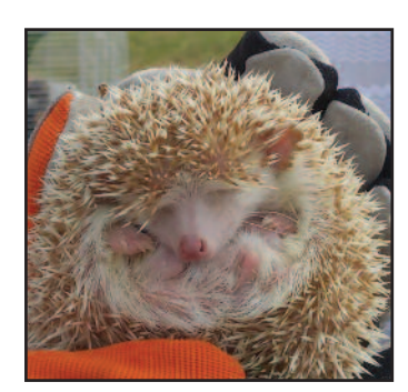
Meet the baby porcupine.