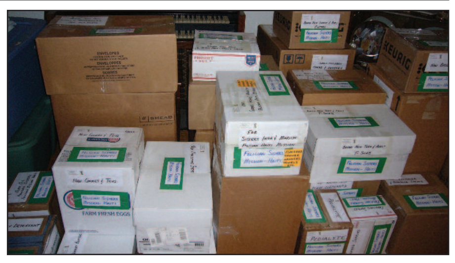
Some of the gift boxes tagged for the Haiti Mission en-route from Bayonne.

Versatility members conducted their "Summer Christmas" project for the benefit of the Felician Mission in Haiti. A large assortment of toys, school supplies, art kits, clothes, undergarments, shoes, healthcare items, and sweet treats were filled into parcels for shipment to the mission complex that is operated by the Felician Sisters in Jacmel. The New Jersey elves coordinated the TEAM WORK project to bring joy to the children in one of the poorest parts of the world. It was a wonderful display of fraternal spirit and the members look forward to organizing another "summer sleigh" project next year.