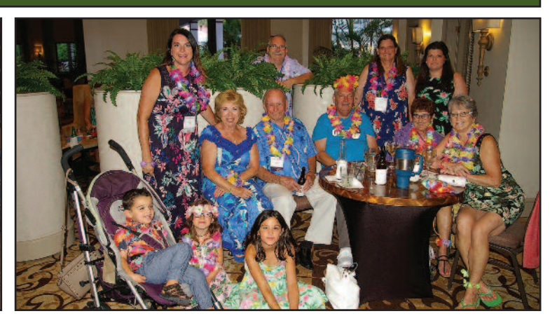
Coronation Council #2224 caught the island spirit at the theme party.