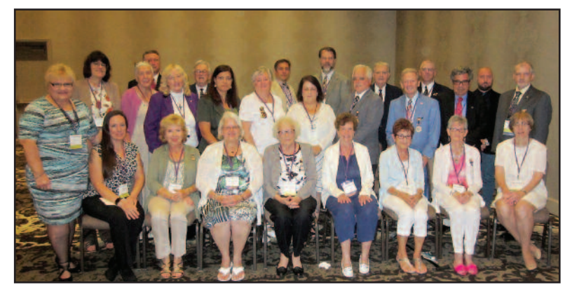
Participants in the Memorial Service Tribute