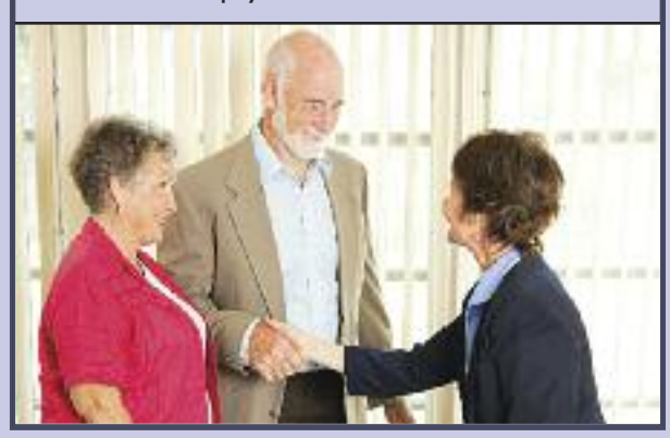
W W W . R O Y A L A R C A N U M . C O M